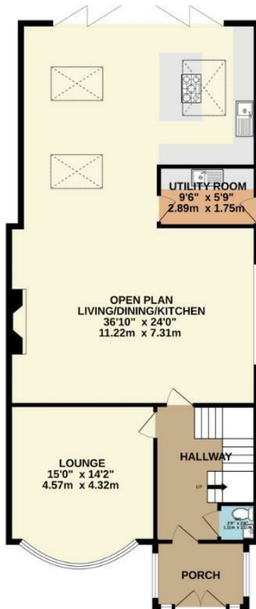
GROUND FLOOR 1250 sq.ft. (116.1 sq.m.) approx.